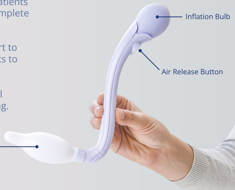
Inflated Silicone Balloon

The result is easier, more complete bowel movements and voiding with less straining.